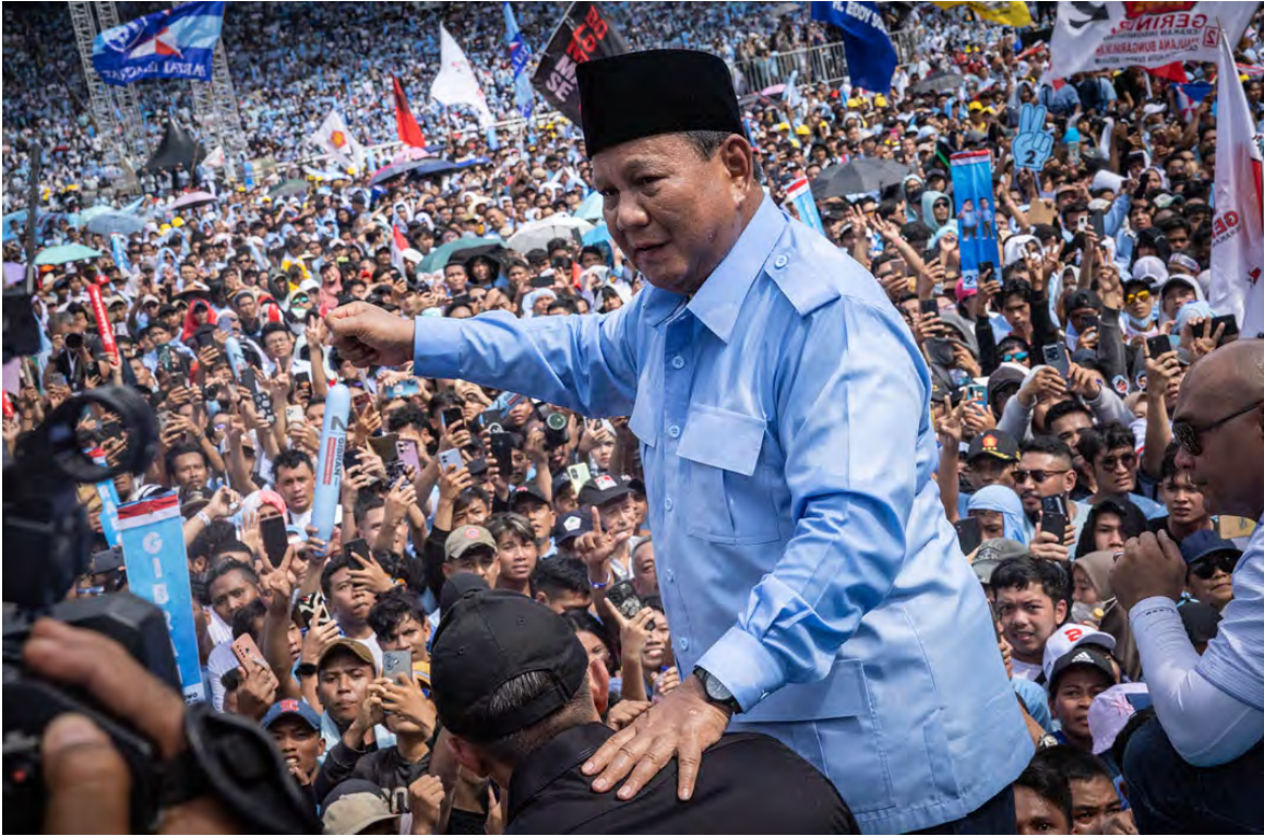
War criminal General Prabowo Subianto, declared victory in the first round of the Indonesian elections