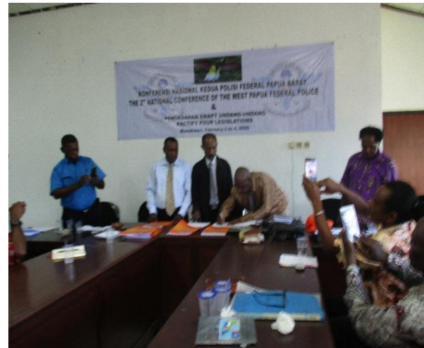
Ratified and signed four legislations by Prime Minister

Papuan People's Representative Council (PPRC). Legislative or the power to create laws and policies. Chairmen of the Papuan People's Representative Council has just ratified four legislations at the first historical session of the Provisional Government at Manokwari on February 3 to 4 February 2020. Those four legislations are: